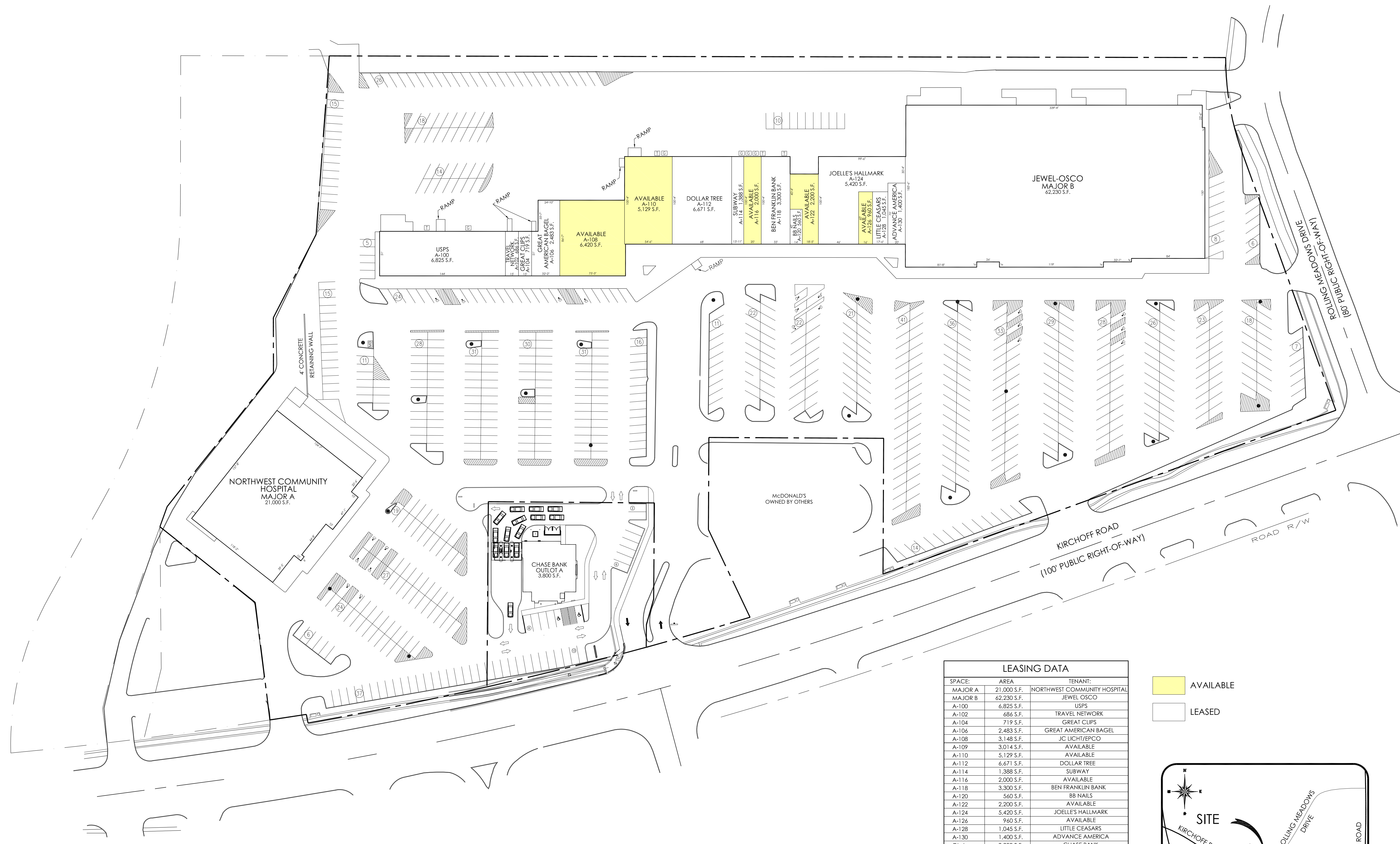
LEASE/SITE PLAN SCALE: 50' = 1"=0"

Dates: JULY 16, 2009 NOV. 18, 2009 MAY 3, 2010 AUGUST 16, 2010 SEP. 15, 2010 OCT. 15, 2010 FEB. 10, 2011 MAY 10, 2011 NOVEMBER 11, 2011 JANUARY 23, 2012