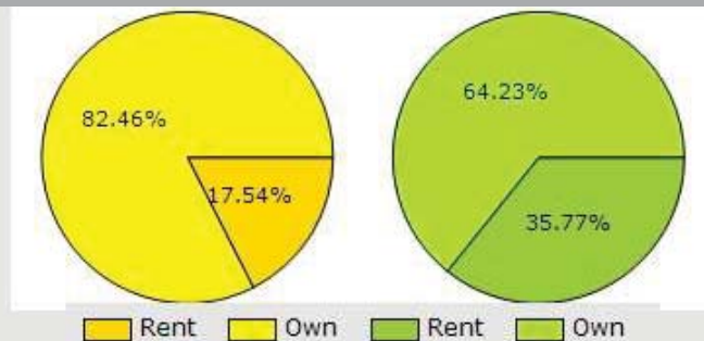
2011 Renter vs. Owner