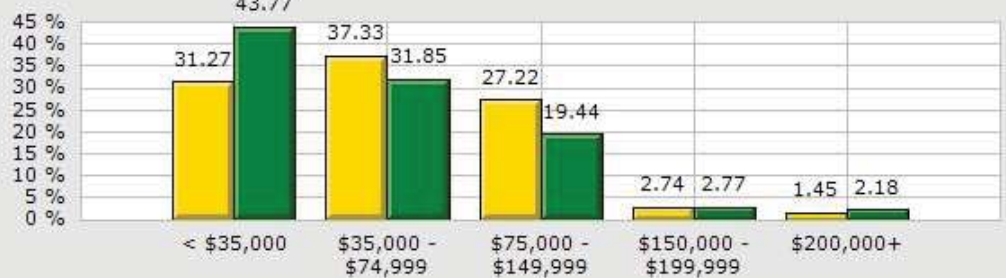
2011 Households by Household Income