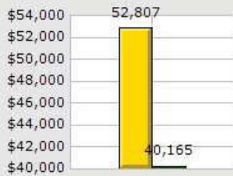
2011 Med Household Inc